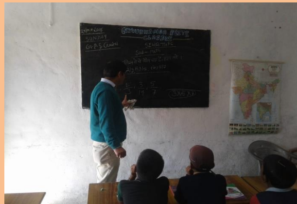
Chaukhamba Elite Classes

We have normally kept it as a benchmark that every topic should be understandable and retained by at least 75% strength of a particular class after 3 rd revision.