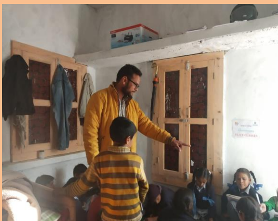
Extra Class at Gairi Centre

At Uppu Centre the extra classes are being conducted at our office in Silla Uppu village. At Silari Centre the extra classes are being conducted in three places one at our office in Village Gairi Rajputon Ki the second at village Silari and the third at Village Kordi.