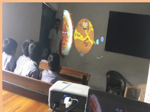
Smart lecture of Elite Class through Projector

The concept of ECs is to focus on grooming of the underprivileged bright students in these schools aspiring for the entrance examination of prestigious institution like Jawahar Navodaya Vidyalay, Rajive Gandhi Navodaya Vidyalay, Sainik Schools ,Military Schools and RIMC through teaching of Science, Maths, Reasoning/ Aptitude Test, English, Hindi and Computer Education by Elite Faculties