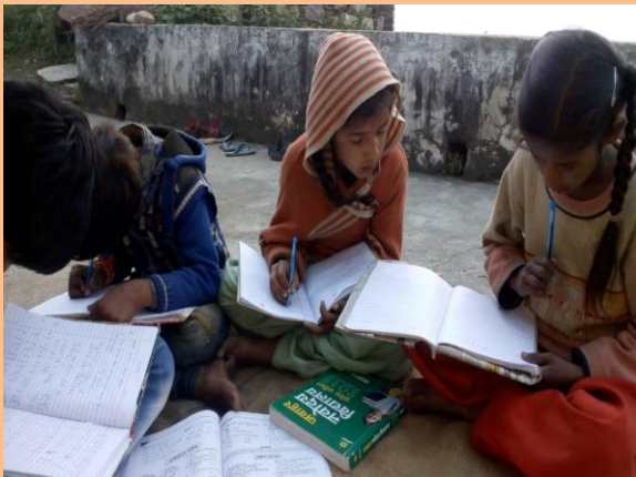
Extra class for bright students

Classes are in support to the Govt. Education System during school hours without disturbing any subject periods, the Elite Classes being mostly held during off school hours and in those periods which are vacant by some reason during school hours. The duration of each period of EC is 45 minute during school hours in conformity with the duration of each class in Govt. System. During off school hours each period consists of 35 minutes and about 4 periods in each day. Apart from the periods for all the students of respective Classes we have the provision of Extra Classes; these extra classes are being conducted during off school hours mostly in the evening time for those students who perform well in the regular, quarterly and half yearly tests.