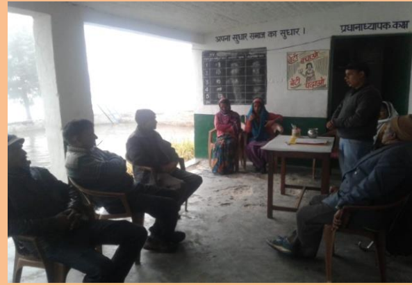
Meeting at GPS Silari

b). After the commencement of classes we found that still many of our students were being absent from their schools due to their involvement in household work and petty economic activities of rural household. We had special counselling session for those students and parents we approached for getting them sensitised it was indeed a very difficult task as whenever we visited to these parents they nodded in yes but after a few days they were back to square one.