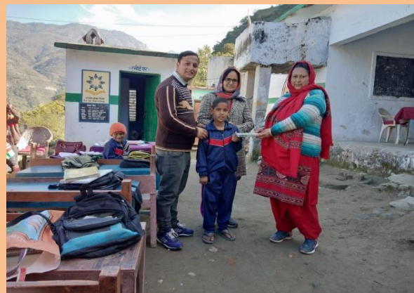
Rewards given to best performing students