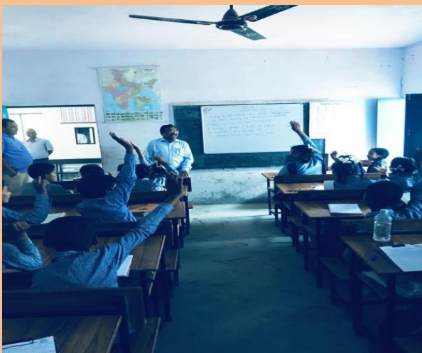
DGM (CSR) THDCIL, Tehri on monitoring visit Saur Uppu