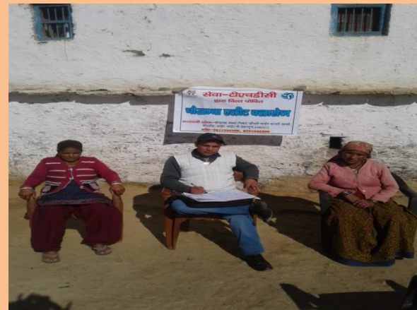
counselling of parents and students

This exercise became our regular activity for about 3 months since we intervened through ECs, we really found it tough to convince the parents as every student seems to have a priority role defined in his household and going school was a secondary activity. By the end of September we had almost full strength on regular basis in our elite classes.