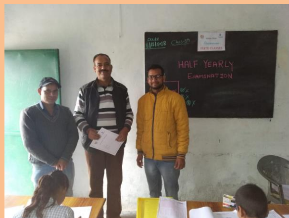
Half yearly Test of Elite Classes

The following table shows the number tests conducted during last 6 months;