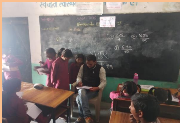
EC Faculty checking given home work

d). Revision of syllabus after completion: Once we complete the syllabus we make revision of topic till we could not achieve 80% scoring in that topic in different tests.