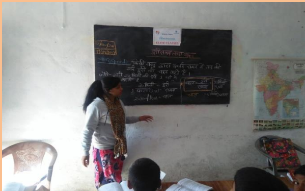
Chaukhamba Elite Classes

consists of practical example that could be understandable to a rural student which he faces on day to day basis.