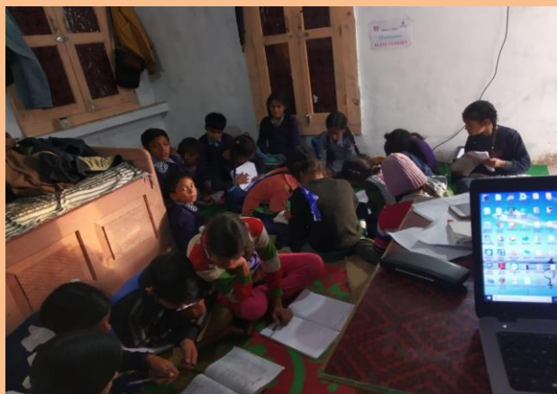
Extra Class at Gairi Centre

At Uppu Centre the extra classes are being conducted at our office in Silla Uppu village. At Silari Centre the extra classes are being conducted in three places one at our office in Village Gairi Rajputon Ki the second at village Silari and the third at Village Kordi.