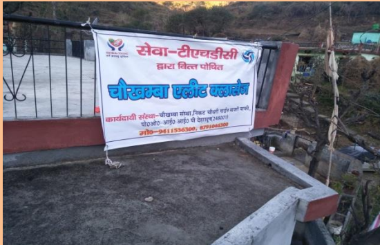
Elite Class Centre at Uppu , Thauldhar Block