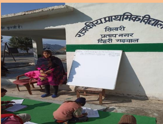
Chaukhamba Elite Classes

We have normally kept it as a benchmark that every topic should be understandable and retained by at least 75% strength of a particular class after 3 rd revision.