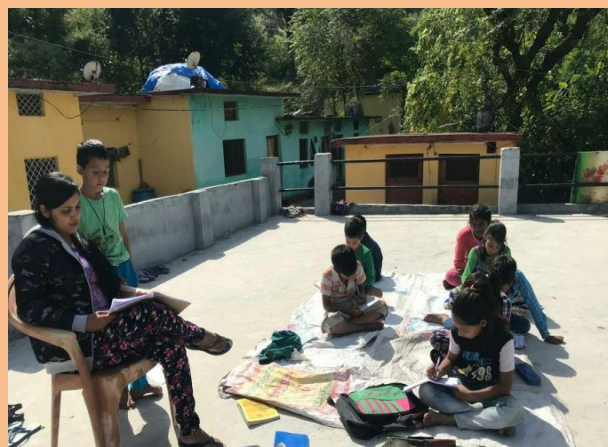
Extra Class at Uppu Centre

The total number of extra classes during past six months is given in the following table;