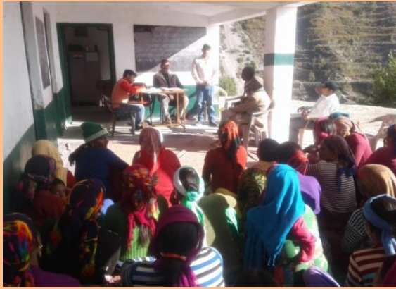
Meeting at GPS Gairi