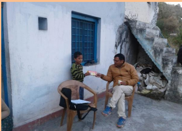
Rewards given to best performing students

Those students who performed well in the routine and special tests are being motivated through different kind of gifts.