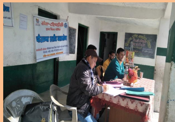
Regular training session are organised for Chaukhamba Faculties