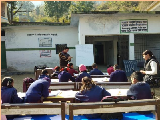
Chaukhamba Elite Classes

Every topic that is being covered in a particular day also gets revised in 8 th day and subsequently on 28 th day from the day of its deliverance. This schedule is prepared while keeping in mind the nature of human brain for understanding a new thing and keeping this thing in its permanent memory for ever remembrance.