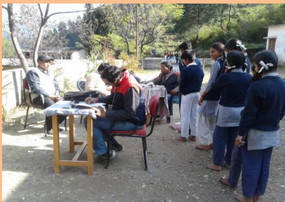
EC Faculty checking given home work

c). Regular check up of given home work and follow up: Every day an EC student is given home work of the covered topic which gets checked by the faculties and randomly being verified by the EC Principal.