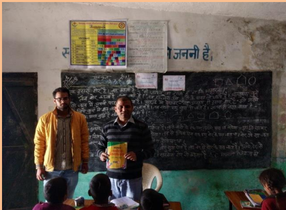
DEO, Pratapnagar at GPS Kordi in Elite Class