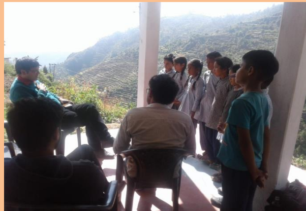
Project Director evaluating at in EC Gairi Centre

The monitoring and evaluation of the project is also being carried out by the parents, and by the office of the local MLA and school staff as well.