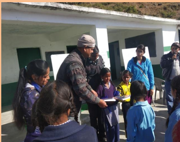
Distribution of Study Material

Chaukhamba has distributed study material to every student of Elite Classes. Also the students of Class V and VIII were given text book for JNV Entrance examination.