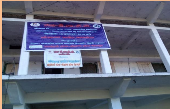
Elite Class Centre at Gairi, Pratapnagar Block

We have two centres of Elite Classes one is at village Uppu in Thauldhar Block and another at Silari in Pratapnagar Block. Total 8 regular teaching faculties have been deputed for delivering ECs in each of the targeted School and 1 regular Elite Class Principal for managing the overall programme ensuring the effective implementation of the ECs in these Schools. The teaching faculties for delivering ECs have been recruited through an advertisement published in newspaper by an interview panel constituted of the representatives of SEWA-THDC and Chaukhamba.