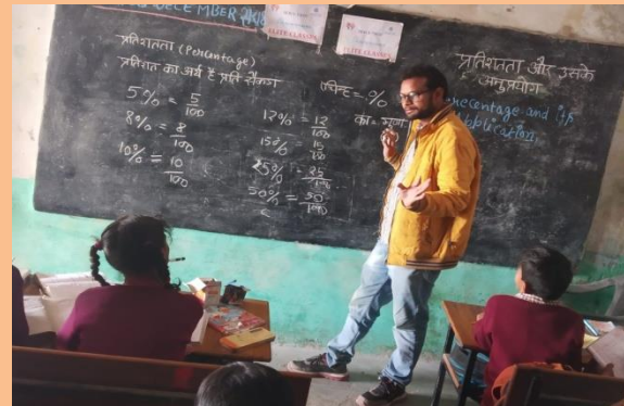
Chaukhamba Elite Classes

Every topic that is being covered in a particular day also gets revised in 8 th day and subsequently on 28 th day from the day of its deliverance. This schedule is prepared while keeping in mind the nature of human brain for understanding a new thing and keeping this thing in its permanent memory for ever remembrance.