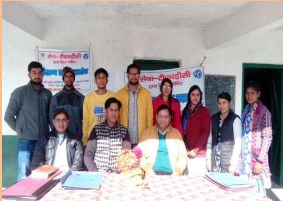
Chaukhamba's faculties of Elite Classes

We have two centres of Elite Classes one is at village Uppu in Thauldhar Block and another at Silari in Pratapnagar Block. Total 8 regular teaching faculties have been deputed for delivering ECs in each of the targeted School and 1 regular Elite Class Principal for managing the overall programme ensuring the effective implementation of the ECs in these Schools. The teaching faculties for delivering ECs have been recruited through an advertisement published in newspaper by an interview panel constituted of the representatives of SEWA-THDC and Chaukhamba.