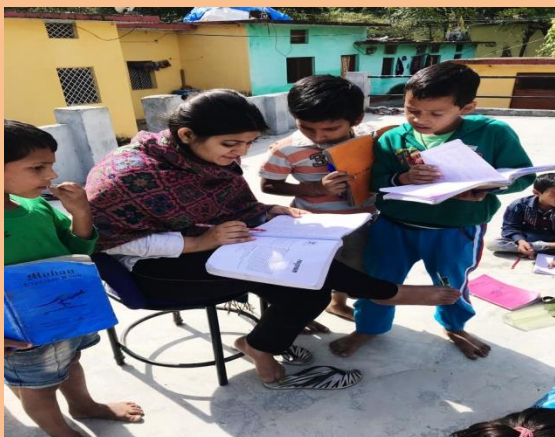
Extra Class at Uppu Centre

We have kept the provision of extra classes for those students who perform well in the unit tests, quarterly and half yearly tests. The purpose for such classes is to identify rural talent and get it nurtured for bringing out the best performance of the students.