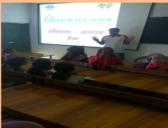
Motivation of parents through PPT Presentation

The ECs were started in the month of July 2018 after prior permission of the concerned Education Departments of School Education in the state, district and block level as well.