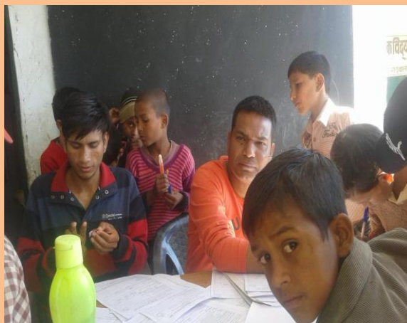
Distribution of Study Material