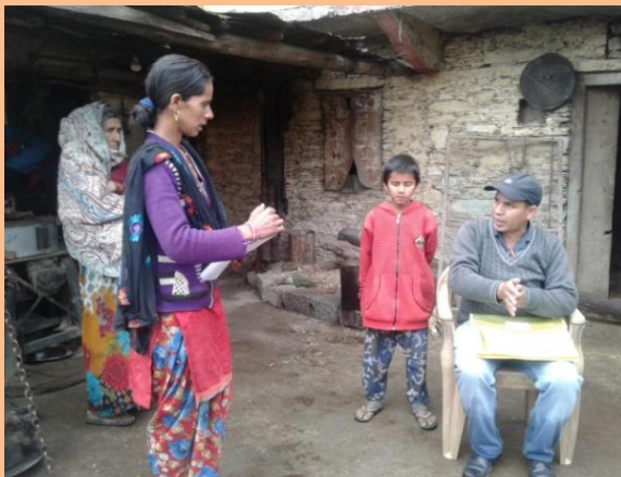
Counselling of parents and students

b). After the commencement of classes we found that still many of our students were being absent from their schools due to their involvement in household work and petty economic activities of rural household. We had special counselling session for those students and parents we approached for getting them sensitised it was indeed a very difficult task as whenever we visited to these parents they nodded in yes but after a few days they were back to square one.