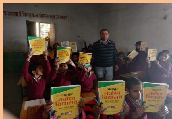
DEO, Pratapnagar visited and inspected ECs

The ECs are being conducted on regular basis free of cost during school hours and off school hours and on holidays including Sundays. The Elite