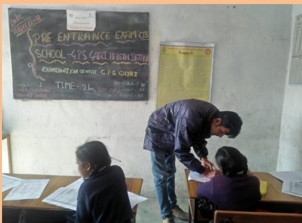
Pre Entrance Test on the basis of JNV Exam

For evaluation of the ECs and in order to take the best performance we have the provision of Tests Series for the students.