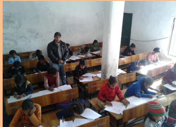
Special Test for students of Uppu and Silari Centres

According to our experience in past six months, we have conducted a sizable number of EC lectures during school hours as some of the schools do not have sufficient teaching faculties. Even where there are no such issue, we get the maximum cooperation from the parents, school authorities and govt. teachers as we could manage to make our own space by delivering the quality education and performance of the students availing elite classes got better after introduction of ECs so mostly we got the maximum time there to deliver elite lectures. For example since beginning of ECs, there is only one Govt. teacher in GPS Saur Uppu so we get the sufficient time to deliver our ECs during school hours in GPS, Saur Uppu.